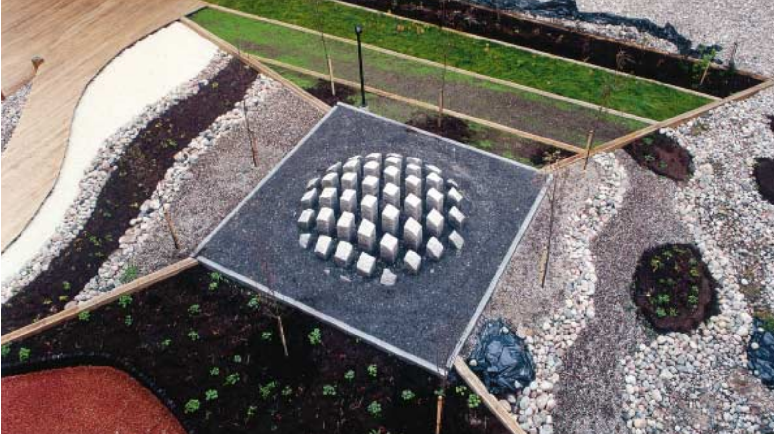
▲ Dan Lestander "HEMISPHERE"

This is a granite sculpture in which the spaces and the play between light and shadow are important integral parts. In its outdoor setting in the south inner courtyard, the sculpture changes with the yearly and daily nuances of natural light. The work was inspired by the midwinter sun and the midnight sun. Location: The south inner courtyard, "The Courtyard of the Senses"