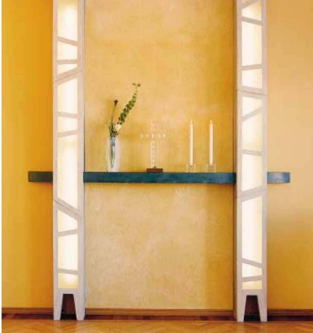
▲ Sara Edström

Location: The reception area at the cardiac intensive care unit