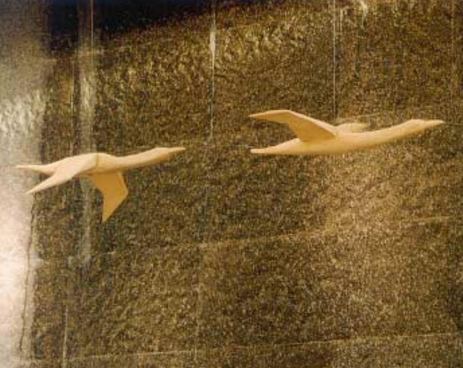
▲ Torsten Renqvist "THREE LOONS" Creatures of Nature that have remained in the building, but not as prisoners-rather more like casual visitors. Location: The main entrance