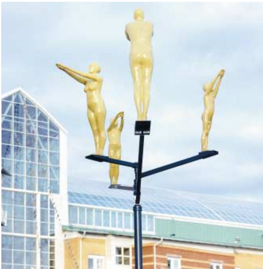
◀ Ulf Rollof "THE GYRO FAMILY" This sculpture depicts two adults and two children, each standing on a blade in a mobile three metres up in the air. They rotate in their own circles, often approaching one another and meeting, then immediately gliding apart and leaving one another. Just as in real life, sometimes they meet, sometimes they go their separate ways. The hospital is like the hub of a wheel. Families gather here during important stages in their lives, positive as well as negative. This sculpture expresses how a whole family will meet in the course of a day, but when, no one knows. It isn't possible to foresee when they will meet, just as we cannot foresee if or when we will be taken ill. Location: The hospital park