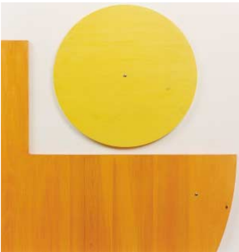
▲ Agneta Andersson "SUMMER GAME"

This is a granite sculpture in which the spaces and the play between light and shadow are important integral parts. In its outdoor setting in the south inner courtyard, the sculpture changes with the yearly and daily nuances of natural light. The work was inspired by the midwinter sun and the midnight sun. Location: The south inner courtyard, "The Courtyard of the Senses"