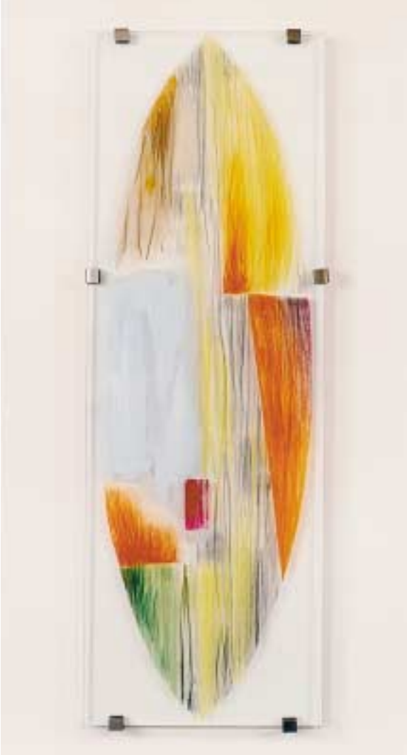
▲ Eva-Stina Sandling